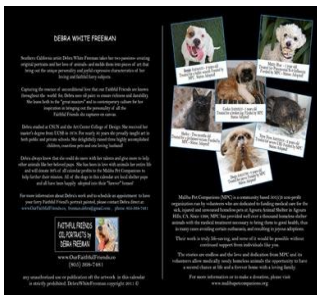
Back of the calendar