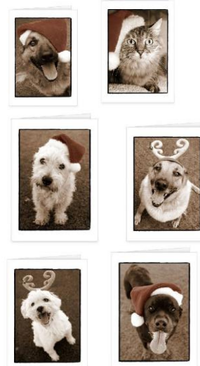
6 or the 8 cards-all featuring MPC funded animals...find Rusty & Mr Tabby on page 2!