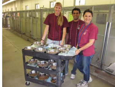
Agoura Animal Shelter volunteers ready to distribute special food.

Kennel Animals requiring Special Care: 20 volunteers a week provide our animals in the kennels special care including hand feeding, physical therapy, over-the-counter supplements for skin conditions and more